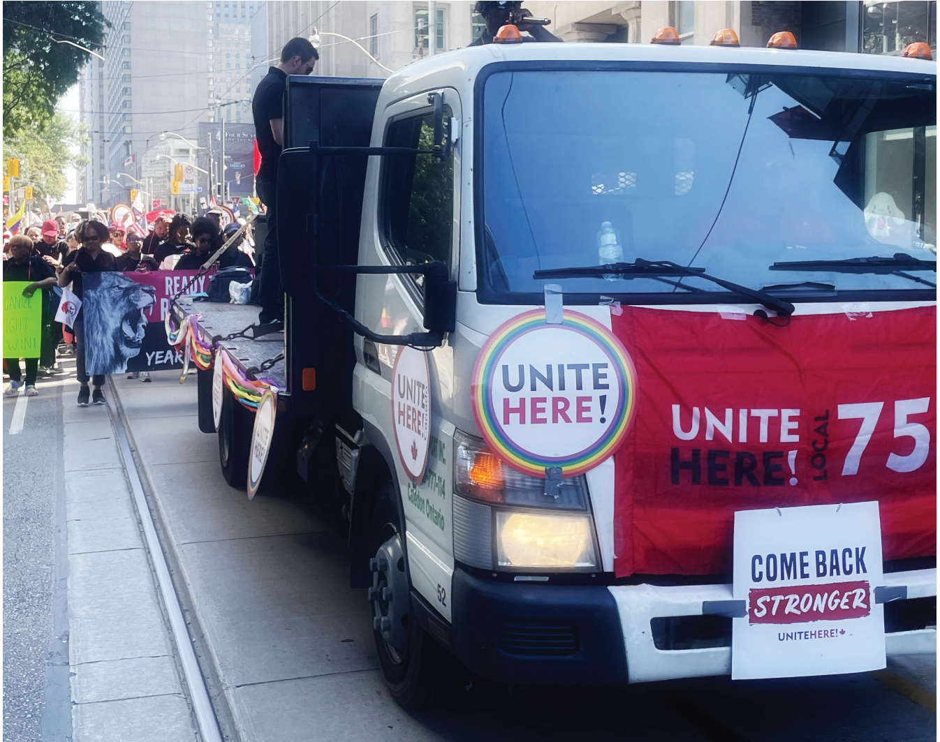
UNITE HERE Local 75 during the Labour Day march in September.

UNITE HERE Local 75 members are a part of the GTA's strongest hospitality and food service workers' union! Our members enjoy industry-leading contracts including the best wages, benefits and working conditions in the industry. If you know a hospitality worker who does not belong to a union and is unaware of their rights in the workplace, help them get in touch with us now!